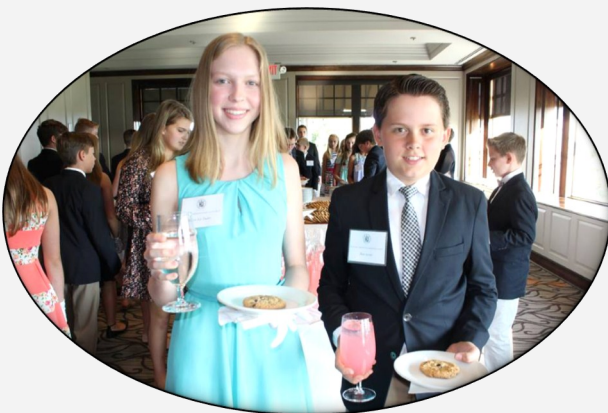
NLJC Allen, McKinney, & Prosper Texas Chapter students enjoy refreshments at their first class.