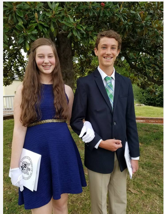
NLJC Northern Guilford Chapter Students enjoying their first class this September.