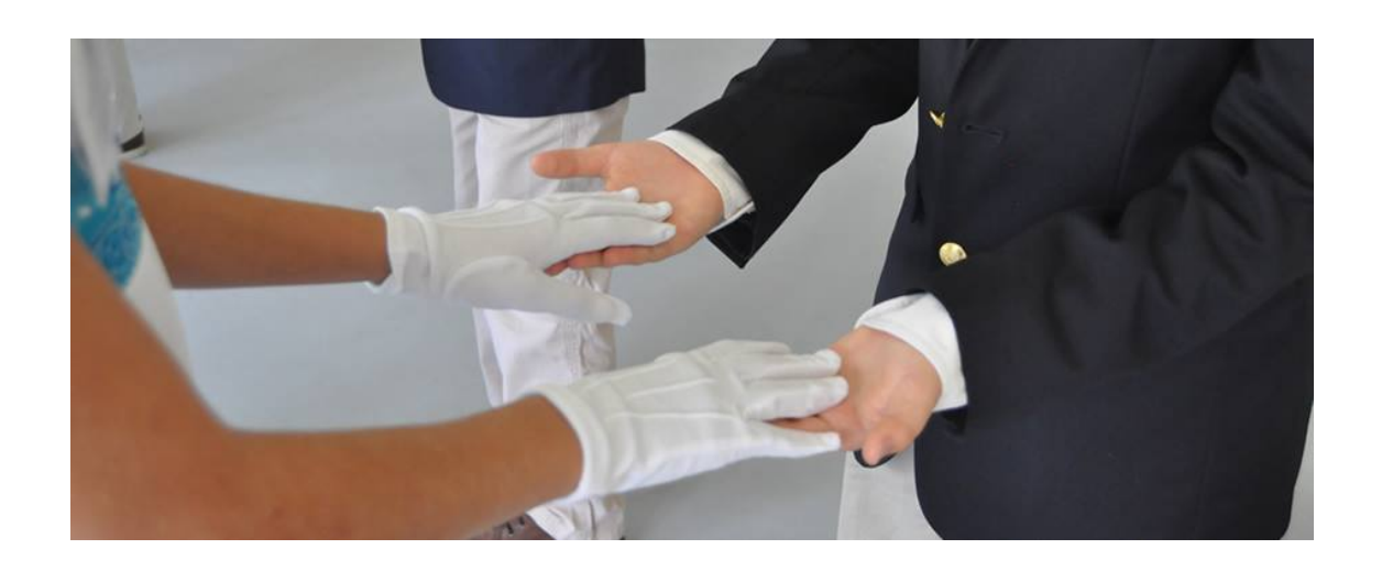
We're pleased to announce a special promotion 10% off all cotilion gloves through 12/31/18. Please visit the following link: <a href="https://www.gloves-online.com/full-fashion-nylon-mens-and-ladies-gloves">https://www.gloves-online.com/full-fashion-nylon-mens-and-ladies-gloves</a>