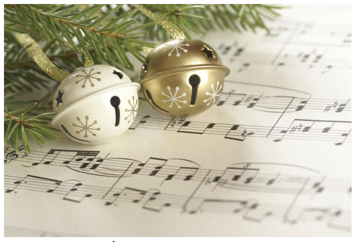
FEATURED: NEW MUSIC